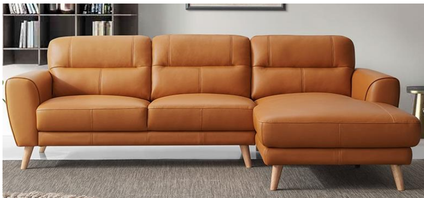
Sofa Chaise (2.5 seat) 1525Lx930Wx880Hmm (chaise) 860Lx1660Wx880Hmm

2 Seater 1520Lx930Wx870Hmm 3 Seater 2075Lx930Wx870Hmm